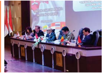
Mikhail Y. Galuzin : "No Countries Can Push through Its Interest at the Disadvantage of Other Countries" page 9