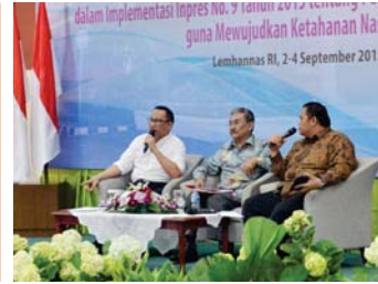
Lemhannas Calls for Revitalization of Public Relations Functions in Bakohumas Nationwide Meeting page 6