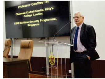
Professor from King's College London and Jimly Asshiddiqie Deliver Lecture on PPSA XX Workshop page 4