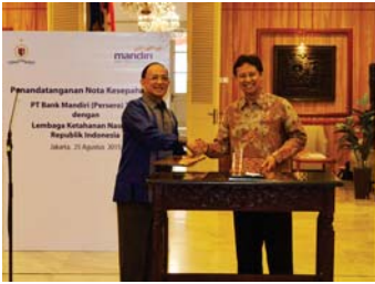
Lemhannas RI and Bank Mandiri Sign MoU page 3